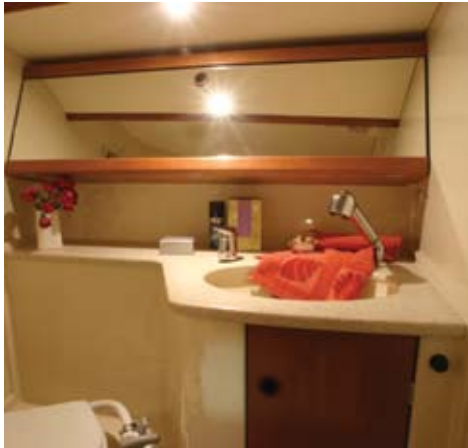
Dufour 385, Bathroom