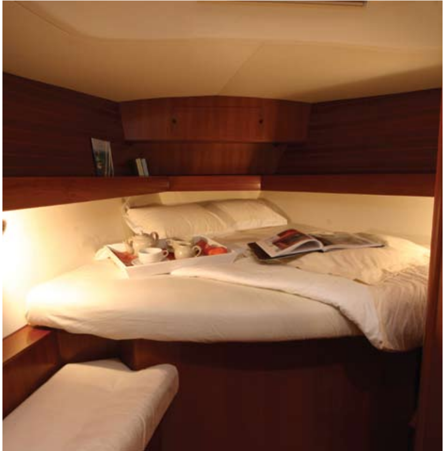
Dufour 385, Master bedroom