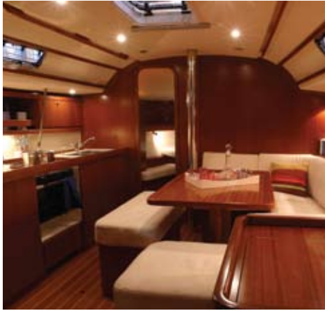
Dufour 385, Saloon