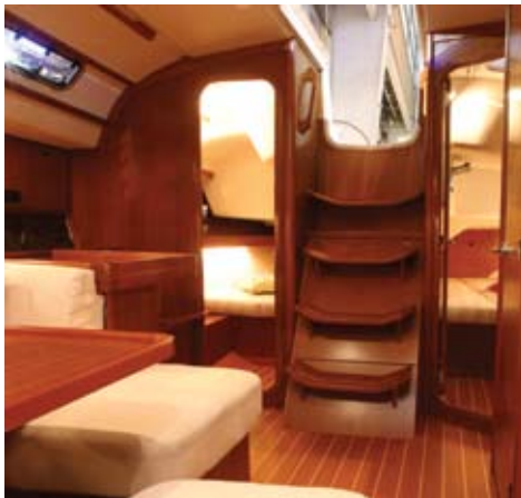
Dufour 385, Cabin Entrance